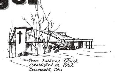
Peace Lutheran Church Established in 1962 Cincinnati, Ohio